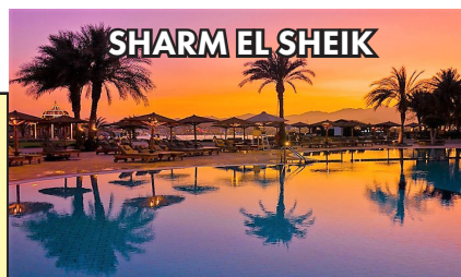
SHARM EL SHEIKH